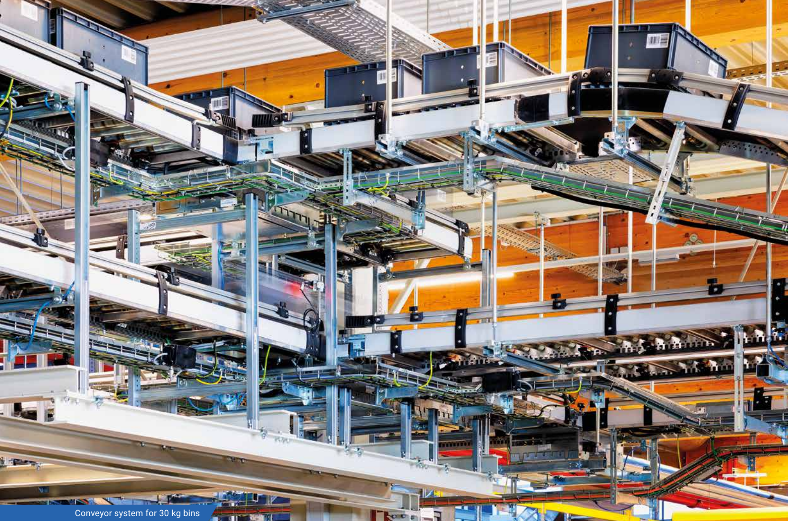
Conveyor system for 30 kg bins

conveyor technology must also be up to the job: 18 goods-in stations, 16 picking stations, 20 packing stations, and 9 vertical conveyors meet these requirements.