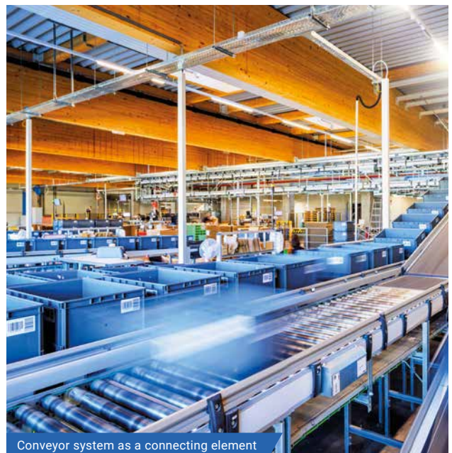
Conveyor system as a connecting element

Close collaboration was required here to implement complex process changes and upgrade the existing software accordingly. Of course, it helped considerably that our company head-